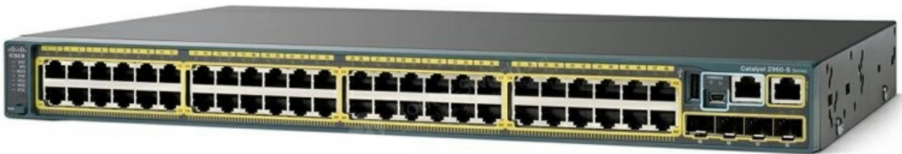
Table 1 shows the Quick Spec of the WS-C2960S-48TS-L.

Figure 1 shows the appearance of the WS-C2960S-48TS-L.