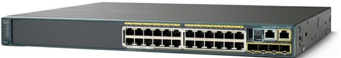
Table 1 shows the Quick Spec of the WS-C2960S-24TS-S.

Figure 1 shows the appearance of the WS-C2960S-24TS-S.