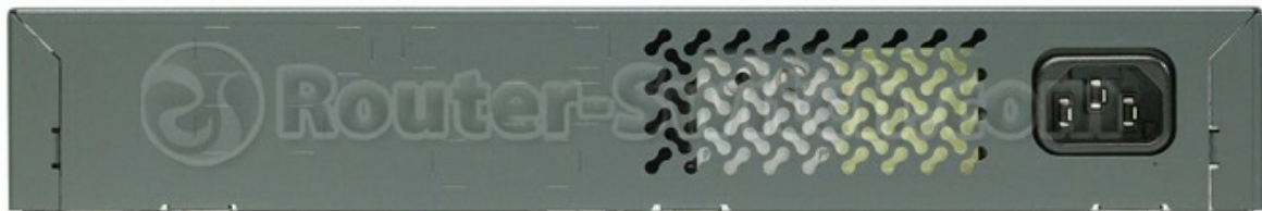
Figure 3 shows the back panel of the WS-C2960-8TC-L.

Note: There are a AC power connector on the back panel. WS-C2960-8TC-L has no fan.