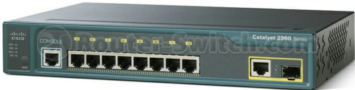
Table 1 shows the Quick Spec of the WS-C2960-8TC-L.

Figure 1 shows the appearance of the WS-C2960-8TC-L.