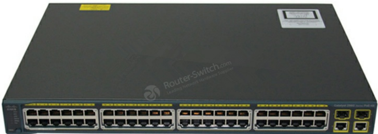
Table 1 shows the Quick Spec of the WS-C2960-48PST-L.

Figure 1 shows the appearance of the WS-C2960-48PST-L.